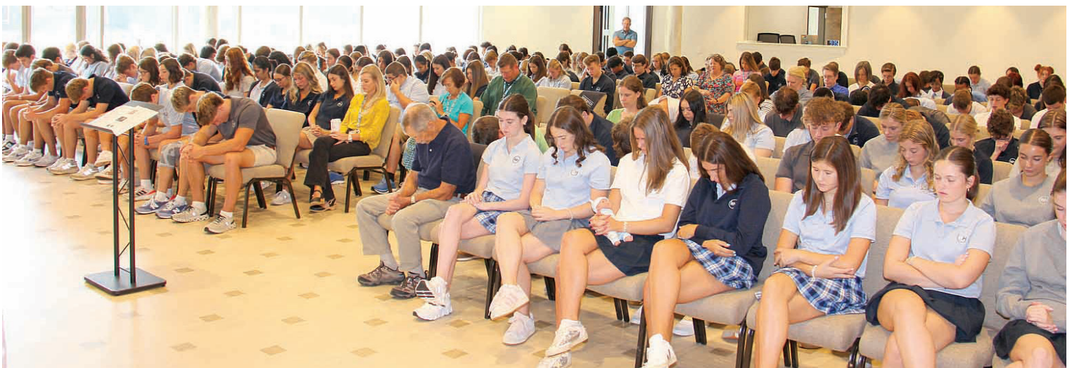
High school students join in prayer in the Founders Chapel at the conclusion of the first chapel program of the year.

stillness and quiet in a world often filled with noise. The message was deepened by the words of Jesus, inscribed on the wall of Founders Chapel: "Come away by yourselves to a quiet place and rest for awhile" (Mark 6:31). With gratitude for the beauty and sacredness of this chapel, the service closed in prayer, reminding all present of the importance of beginning the year grounded in faith and reflection.