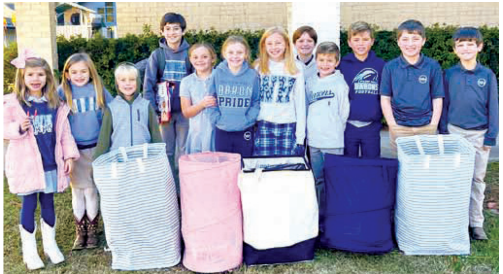
Lower school students deliver items collected for Croswell Home.