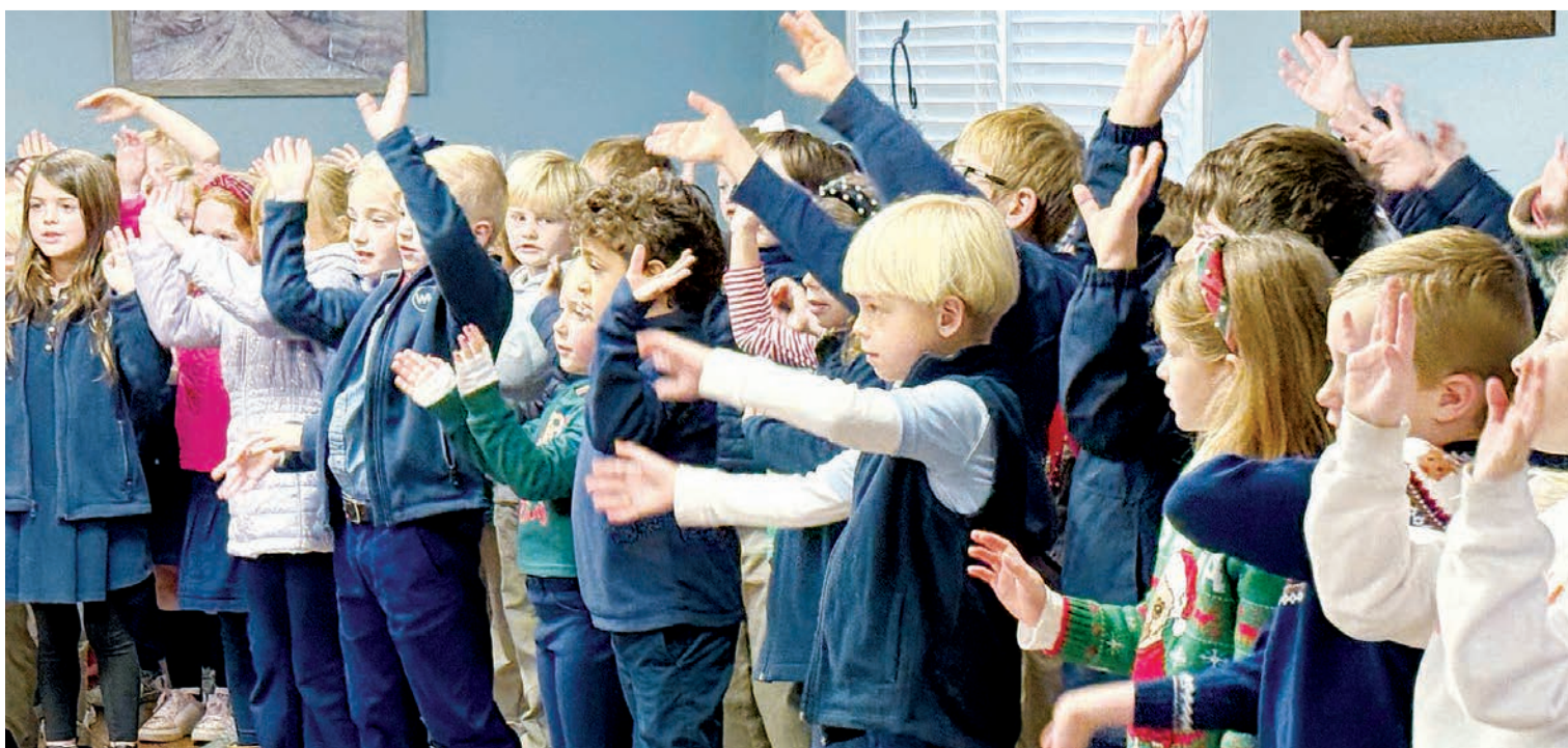
Members of the Class of '37 perform for the residents of Covenant Place.

Bringing smiles to our wider community, the Class of '37 spread holiday cheer during a special visit to Covenant Place, where they sang Christmas carols and shared handmade Christmas cards with the residents. Guided by Mrs.