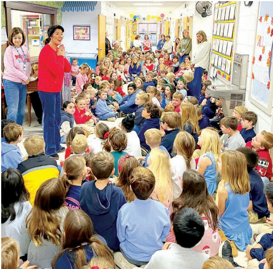
Students gather for "Singing in the Hall."