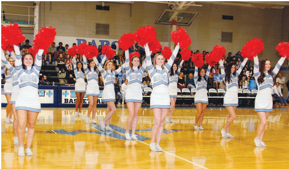
The varsity cheerleading squad performs a special Christmas routine in the Nash Student Center.