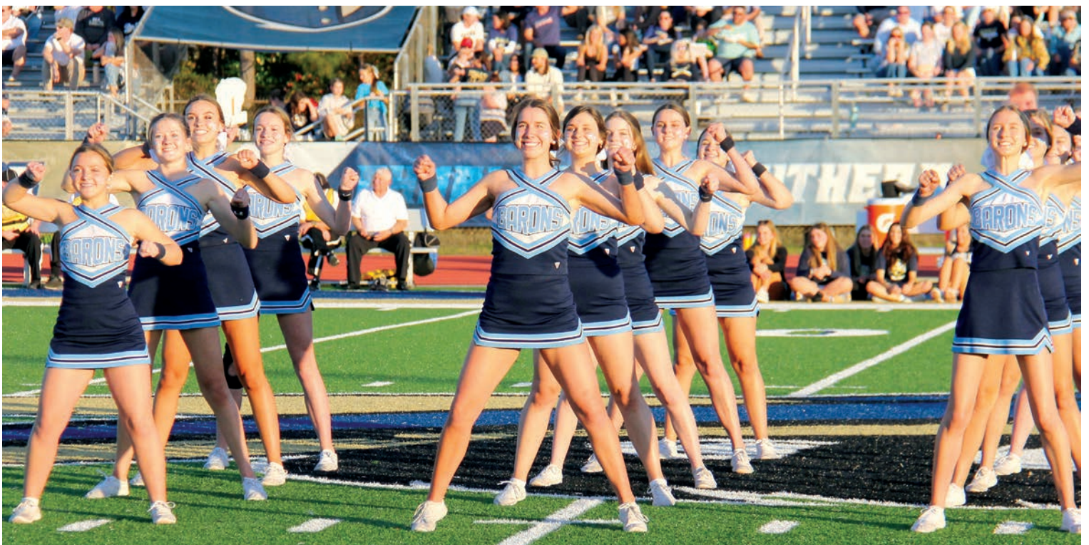
The varsity cheerleading squad performs a half time routine on Buccaneer Field.