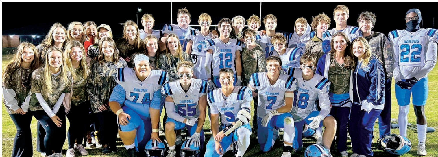
Members of the Class of '24 gather after the varsity football team's semifinal victory at Florence Christian School.