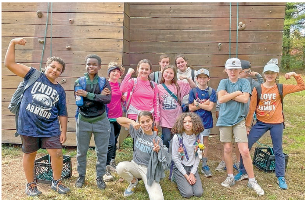
Members of the Class of '30 pose for a photo after conquering the rock climbing wall at the Mountain Trail Outdoor School.