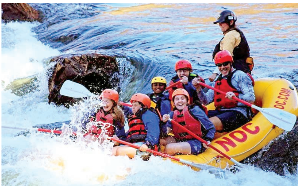
Members of the Class of '30 raft down the French Broad River during their class trip to Camp Kanuga.

Through activities such as white-water rafting on the French Broad River, the Class of '30 experienced an educational and enjoyable trip to Camp Kanuga in Hendersonville, N.C., from October 25-27. The school's 21st trip gave the students the opportunity to participate in four classes taught by the Mountain Trail Outdoor School which is in the Appalachian Mountains. These classes included a cooperation and low ropes course, a hands-on course in rappelling, an orienteering and wilderness survival course, and a course in forest ecology. Students also enjoyed activities to promote bonding and team building with their classmates, such as campfires and recreational games, as well as time for daily devotion. The following faculty members chaperoned the trip: Mrs. Laura Burleson, Mrs. Day Caughman, Mr. George Carruth '06, Mr. Lee Gandy, Mrs. Lori Gandy and Mrs. Lauri Peyton.