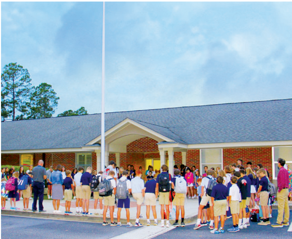
Students, faculty and parents gather in prayer for the See You at the Pole event.