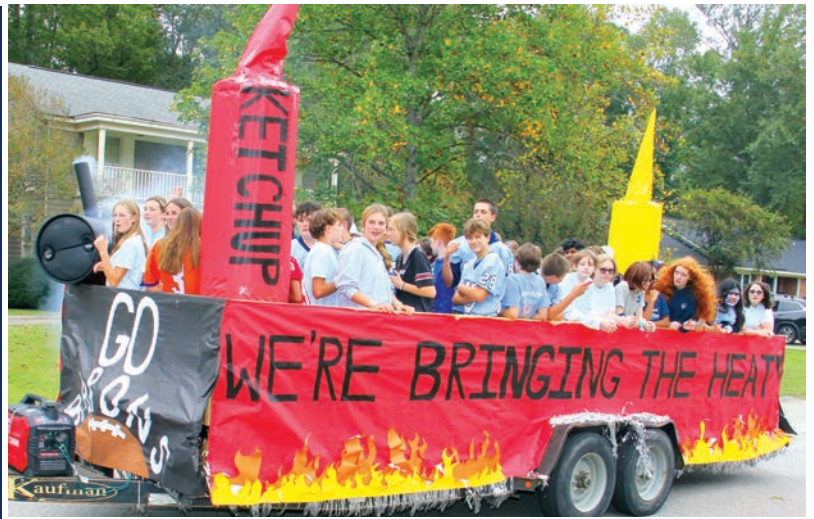
Class of '28