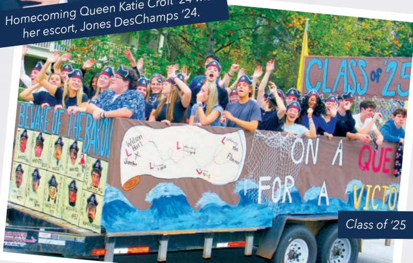
Class of '25