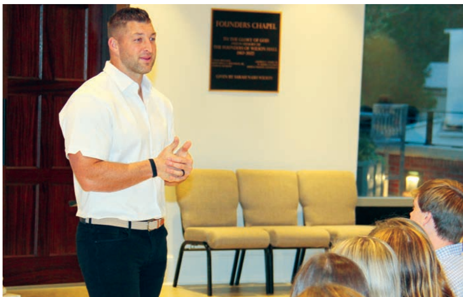
Tim Tebow talks with members of the Class of '24 during an informal question and answer session in the Founders Chapel before the Mission Series program.