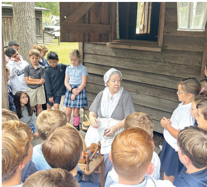
Members of the Class of '35 enjoy hands-on learning during the class trip to the Sumter County Museum.