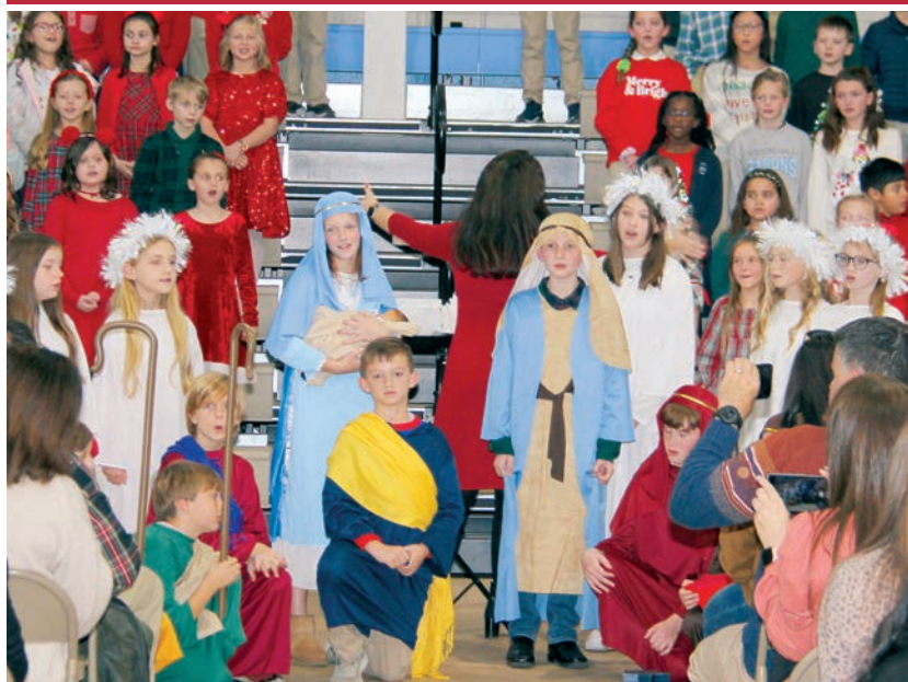
Students recreate the Nativity scene while singing "Silent Night."