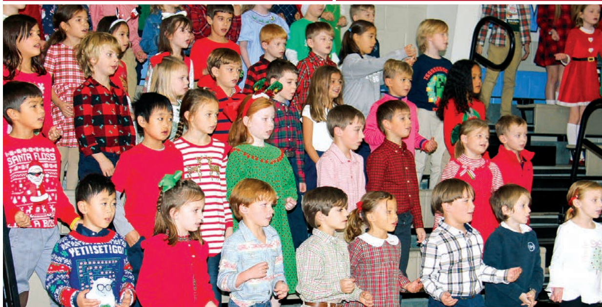
Members of the Class of '35 perform for the standing-room-only audience.